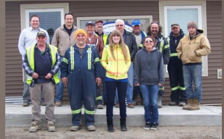
Foothills Regional Landfill Staff SWANA Unsung Heroes 2011